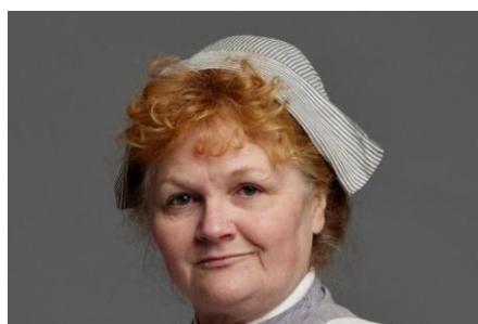
Lesley in her role as Mrs Patmore in ITV's Downton Abbey

He's a big softie, but if he and Bertie are arguing over a bone, Freddie will win hands down. I think his traumatic youth has made him resilient and even the seven times he's flown over the Atlantic haven't bothered him at all.