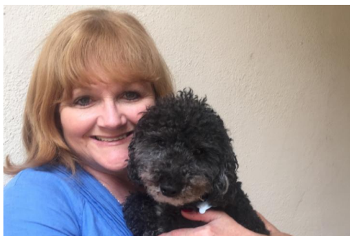
LESLEY NICOL, WHO PLAYS MRS PATMORE IN DOWNTON ABBEY, WITH HER RESCUE POODLE FREDDIE